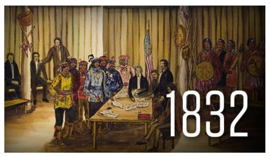
Figure 4: Chickasaw signing of Treaty of Pontotoc Creek.