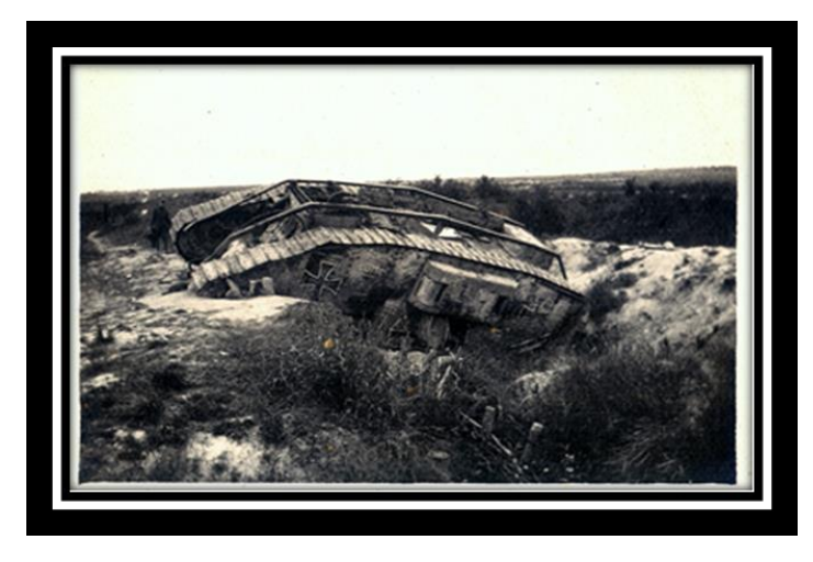
Figure 6: No Man's Land, France

On September 1, 1939, the German attack against Northern Poland began and sparked the beginning of WWII. Once again, thousands of Native Americans answered the call when help was needed. Many Chickasaw men and women joined different branches of the military during WWII. On January 27, 1940, Hitler ordered plans for an invasion of Norway, and in May, the Germans surged into the Low Countries, quickly compelling the Dutch to surrender. On June 22, 1941, German armor attacked the Soviet Union as part of Operation Barbarossa and on December 7, Japan attacked Pearl Harbor, causing the U.S. to join the war.