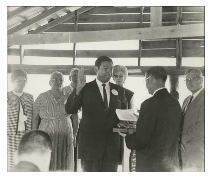
Figure 1: Gov. James being sworn in at Seeley Chapel in October of 1963

In 1856, the Chickasaw people gathered at Good Spring (known today as Tishomingo, Oklahoma) on Pennington Creek to write their own constitution. It provided for a threebranch system of government executive, legislative and judicial. With minor changes over the years, this document served the Chickasaw people well until its dissolution in 1906 in preparation for Oklahoma statehood. From 1906 until 1971,