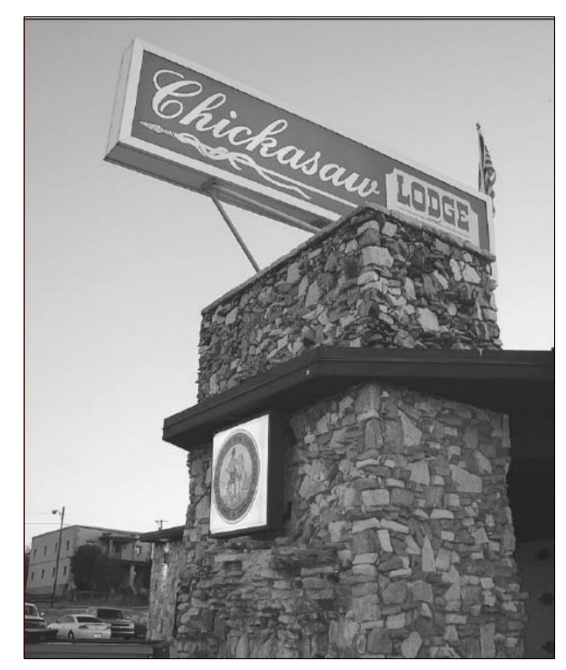
Figure 2: The Chickasaw Motor Inn in Sulphur, OK

Nation in 1963, he took his oath of office at Seeley Chapel, where the grassroots movement had begun.