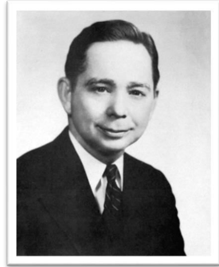
Fig. 4: Carl Albert.

One year after serving in the army, Albert's political career began, and it would go on to span the era of American Indian termination, gradual assimilation and self-determination. The issues of American Indians were nothing new to Albert. The population of his home state was one-quarter American Indian, and his district, the Oklahoma Third, included the Chickasaw, Choctaw and Seminole tribes (Kotlowski 17-18).