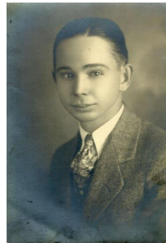
Figure 3: Portrait of young Carl Albert.

Albert valued education from an early age, and he utilized educational opportunities to advance himself both personally and politically. Prior to graduating from McAlester High School in May 1927, Albert scholastically achieved the impossible for a “poor boy,” as he often referred to himself (Albert and Goble 42). He was named class valedictorian, student body president, homeroom president, Golden M. club president and poetry club president (Albert and Goble 42).