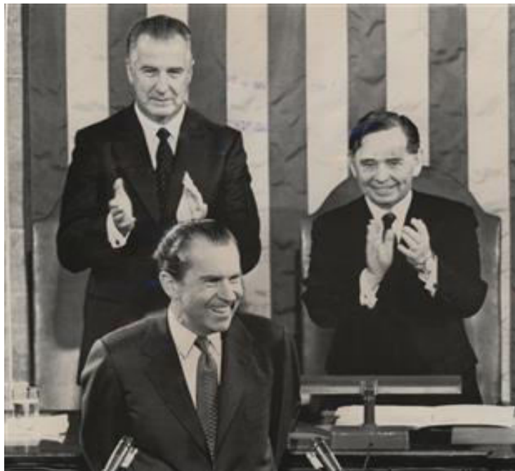
Fig. 5: Speaker Carl Albert, right, and Vice President Spiro Agnew, left, applaud President Richard Nixon during the State of the Union address on January 22, 1972.