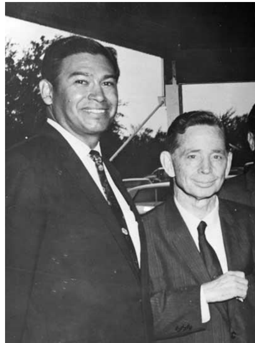
Fig. 6: Gov. Overton James and Speaker Carl Albert.

While the newly opened clinic in Tishomingo was successful, the demand for health services exceeded the clinic’s capabilities. This concern was identified, and Albert, Gov. James and other Chickasaw leaders worked tirelessly to address it. In 1973, Gov. James led the way in winning a competitive proposal to locate a new IHS hospital inside the Chickasaw Nation (Morgan 6). The hospital was a huge step forward for the Chickasaw Nation and its citizens and launched three decades of steady industry and enterprise that have significantly transformed the economy and culture within the boundaries of the Chickasaw Nation (Morgan 6). The tribe’s response to their citizens remains a testament to the mission of the Chickasaw Nation—to enhance the overall quality of life of the Chickasaw people.