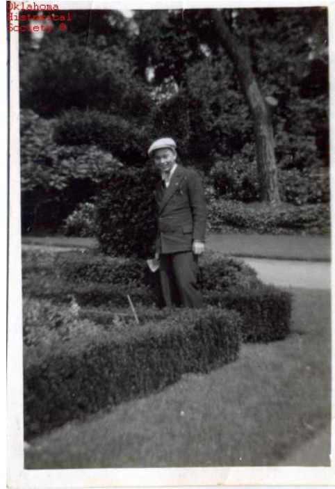
Figure 1: Young Carl Albert posing for a picture.