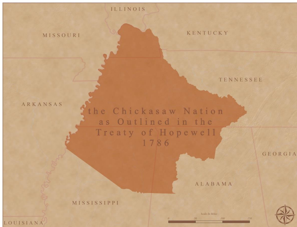
Figure 1: Map of Chickasaw Homelands as outlined in the Treaty of Hopewell 1786

We were a fierce, war-like tribe that originally resided in what is now northern Mississippi, northwestern Alabama, western Tennessee and western Kentucky. Many of our largest settlements were located near the cities of Tupelo, Miss.; Huntsville, Ala.; and Memphis, Tenn. Because of our skill in warfare, we were sometimes called the "Spartans of the lower Mississippi Valley." We even raised our male children much like the Spartans, teaching them military skills and acclimating them to pain and hardship at an early age. 1 The training must have been effective, as historical observers of our tribe often commented on our bravery and courage. A French governor of Louisiana once wrote that Chickasaws "breathe nothing but war and are unquestionably the bravest of the continent." 2