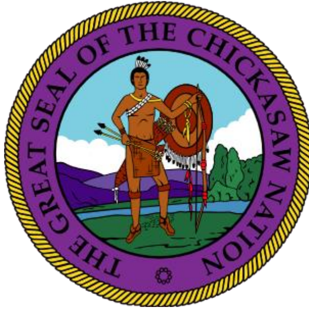
Figure 4: The Great Seal of the Chickasaw Nation.

county in Mississippi and a town in Oklahoma bearing his name. In addition, the Oklahoma state seal features his likeness, as does the Great Seal of the Chickasaw Nation. Tishominko 's memory and exemplary life would serve as a rallying point for Chickasaws during difficult times ahead in the mid-1800s in Indian Territory.