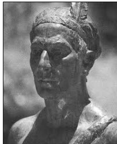
Figure 3: Tishominko statue.

One of the most beloved leaders of the Chickasaw Nation was Tishominko . Born near the Chickasaw Old Fields in Mississippi prior to 1750, Tishominko is remembered as one of the last great “traditional” leaders of the Chickasaws and a noted orator in our language. As a younger man, he served with General Anthony Wayne against the Shawnee-Miamia Indian confederacy in the Old Northwest country of Ohio and Indiana during the 1790s. Historical records indicate Tishominko may have been known as Okoye (“ Oka' Hoyo ” said to mean “water seeker”), or Tishumustubbe (“ Tisho imisht abi ” said to mean “he seized an Assistant for them and killed him”), during this time prior to earning the title of