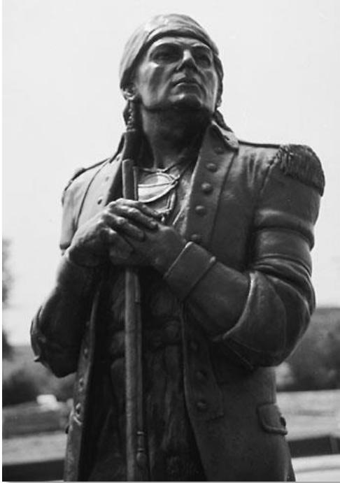
Figure 1: Piominko statue.

Long ago, Chickasaws listened to their clan minko' , or leader, and were guided by their respected elders. Traditionally minko' is the Chickasaw word for leader. Over time this word was spoken and written by Europeans and later Americans as mingo . Although