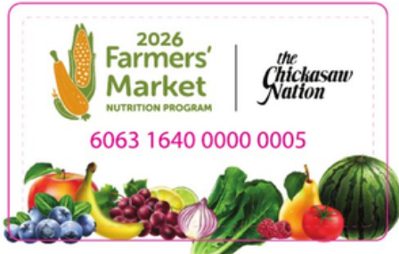
Senior Farmers' Market