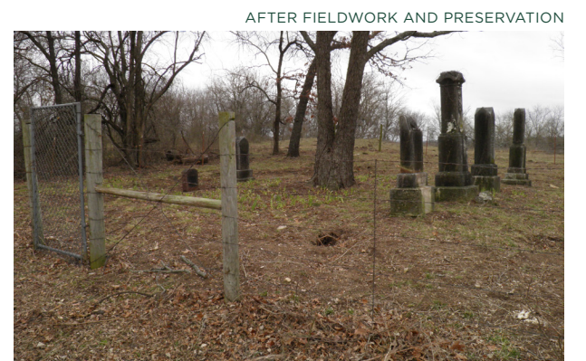
HEADSTONE REPAIR AND CLEANING